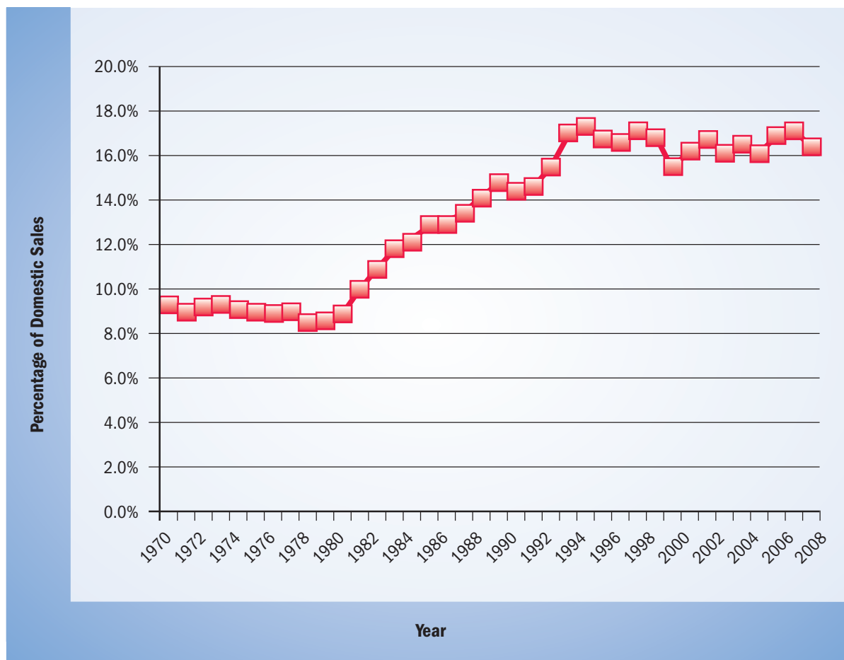
Figure 1: Pharmaceutical R&D as a Share of Sales: 1970–2007