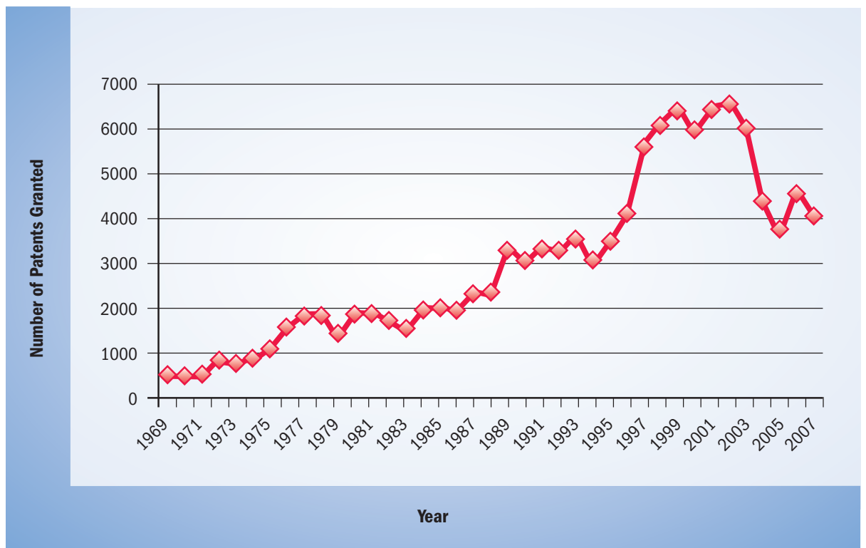
Figure 2: Utility Patent Grants for Drug, Bio-Affecting, and Body-Treating Compositions, 1969 – 2007

Source: http://www.uspto.gov/web/offices/ac/ido/oeip/taf/tecasga/424_tor.htm *The recent decline in new drug patent grants between 2002 and 2007 may reflect an overburdened PTO. For example, according to Annual Performance and Accountability Reports issued by the PTO between 2002 and 2007, filings of patent applications have increased from 353,000 in 2002 to 467,000 in 2007. Total patents pending have increased from 636,000 (2002) to 1.12 million (2007). Lastly, in the Biotechnology and Organic Chemistry Section (Tech Center 1600), pendency has increased from 27.3 months (2002) to 34.3 months (2007).